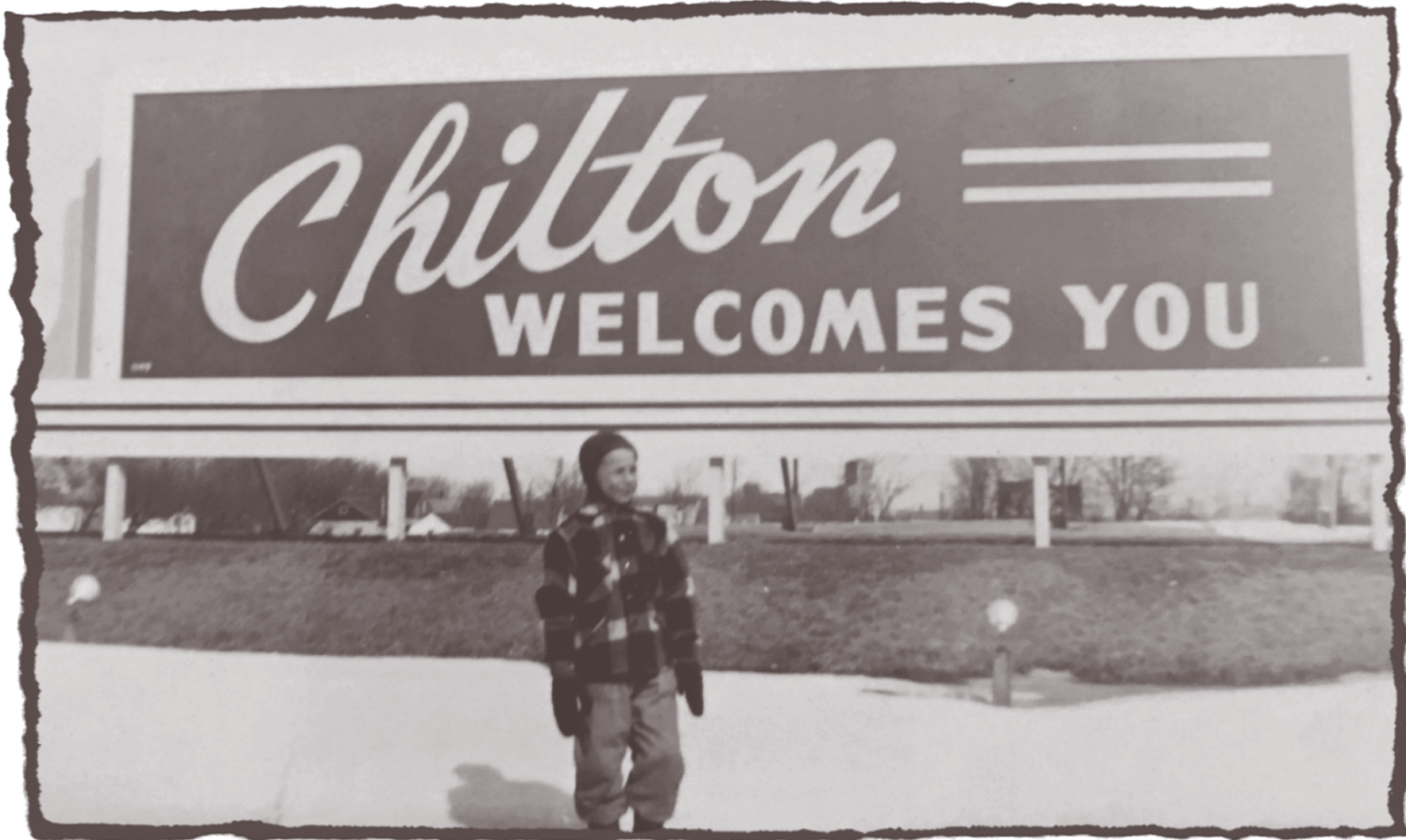
Klinkner Park • 1950