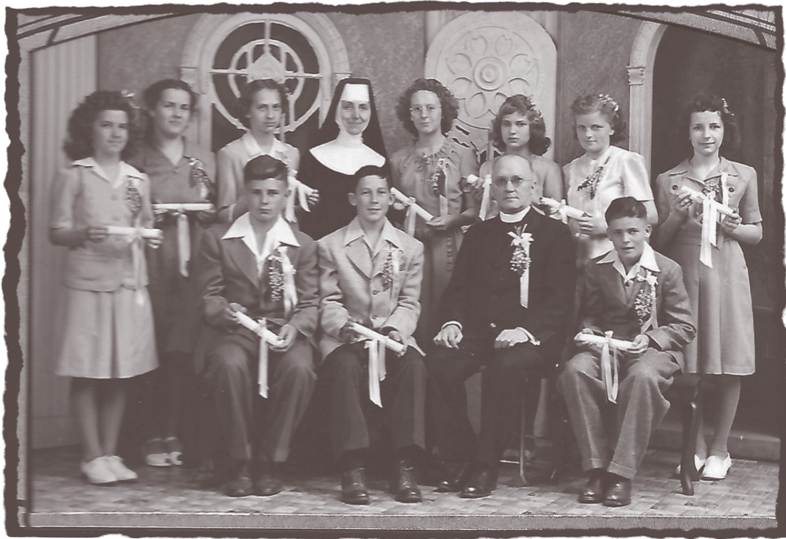
The 1945 8th Grade Graduating Class from St Augustine's School in Chilton, WI.