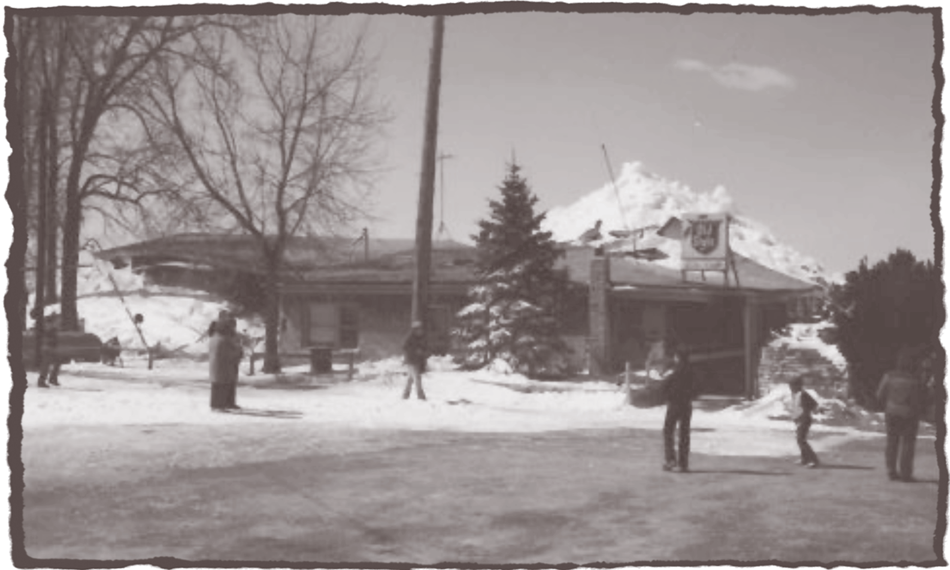
A giant ice shove took out Nemitz Tavern on Lake Winnebago in the Spring of 1977.